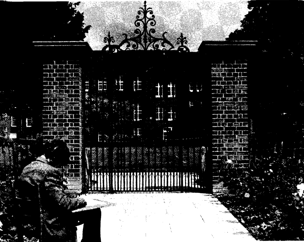
The Croydon Gate.

annually to meet both staff and scholars to consider matters of mutual concern. The structure of the Board was also examined. Like their predecessors, they identified the needs of the Board to be experience and professional expertise in all aspects of school policy and the representation of the school in its constituent area. In order to make new experience available to the Board, they considered proposals for limits by age and by length of service. In 1972 they agreed not to limit by age and received no clear lead about the limit to time of service. Clarity emerged in 1974 when they decided not to alter the existing arrangements. Although there was no formal change, there was a sense that the effectiveness of the Board was so crucial that alterations might be necessary.