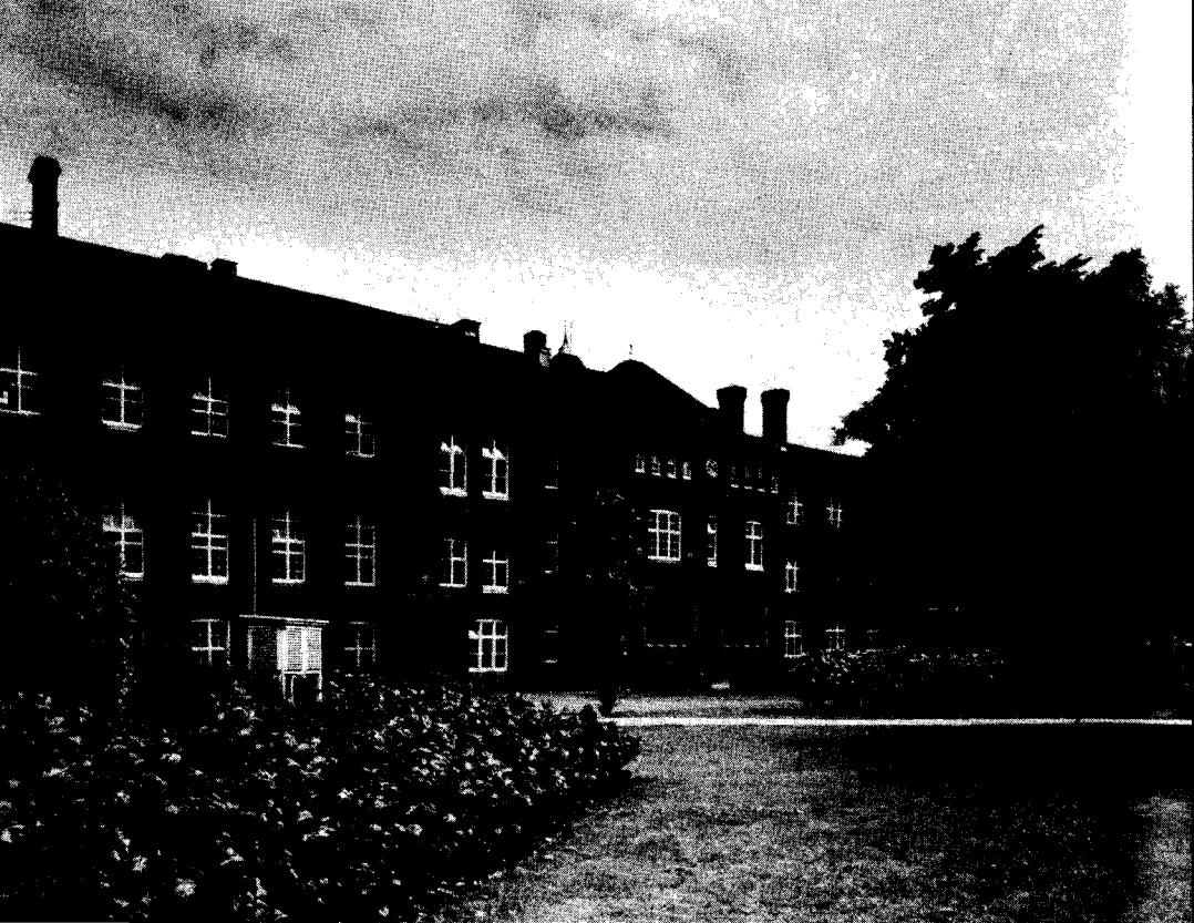
The main building facing south.