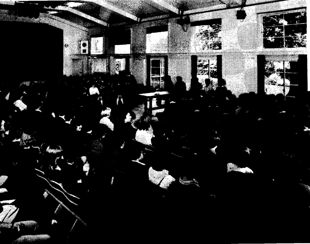
Assembly in the Hall.

for a peaceful future led to definite proposals for further building development. The priority was the academic standing of the school, especially at Sixth form level, and facilities for academic work separate from leisure and living accommodation. The price of this priority was to close the Junior school. This step was regretted but made easier by the school's work continuing separately in the town. The accommodation thus released was converted as Croydon House for dormitories and domestic science. Development plans costing £35,000 were prepared, for which an appeal was launched among friends of the school in 1947. But at a time of annual deficits in the accounts and regular increase in fees, the target was not reached and plans were modified. Alterations to the kitchen and the provision of two new classrooms, with some consequent re-arrangement of use of other rooms, including common rooms separate from classrooms, were all that was possible before celebrations in 1952 to commemorate 250 years continuous existence. A birthday gift of hard tennis courts was completed in time for the formal celebrations. On July 22nd 450 visitors attended an occasion of thanksgiving with worship, an exhibition and specially commissioned music and pageant.