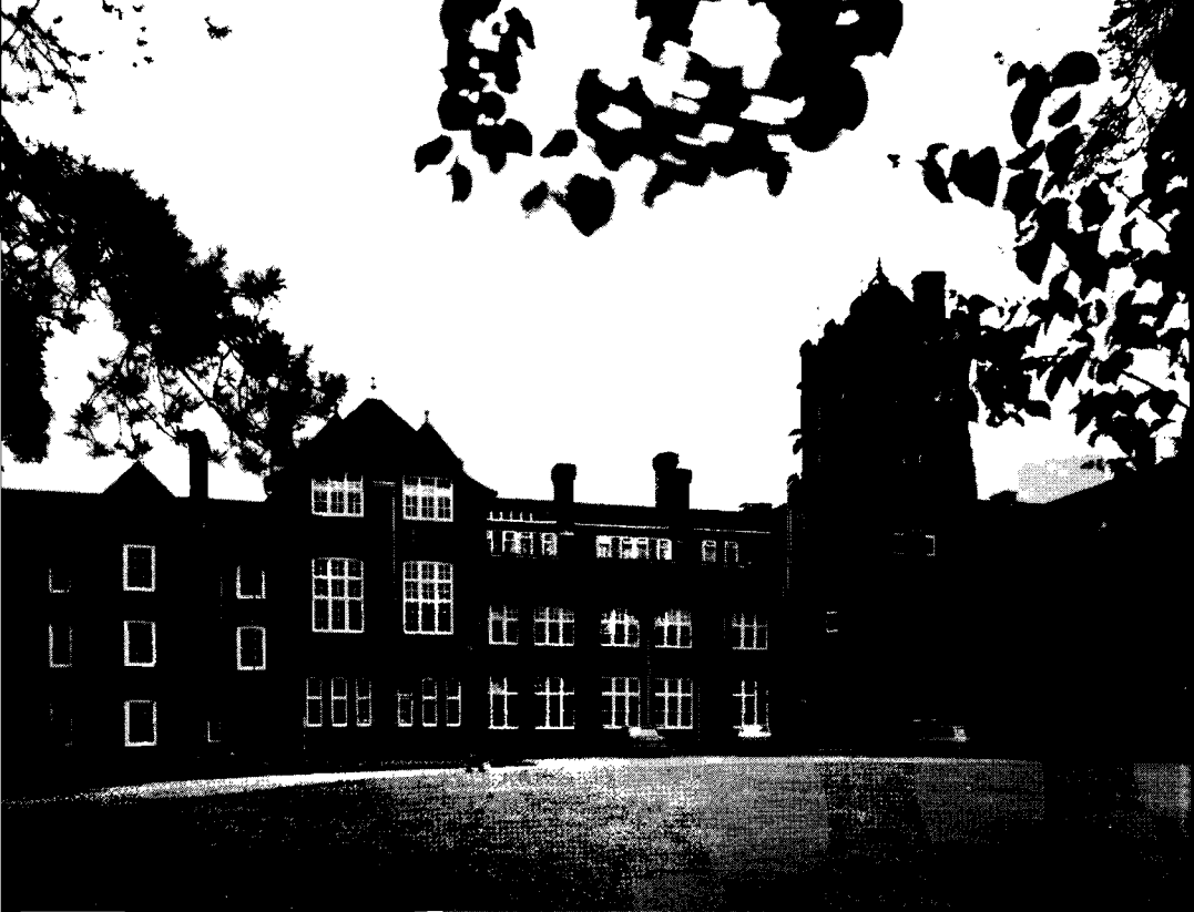
The main building facing north.