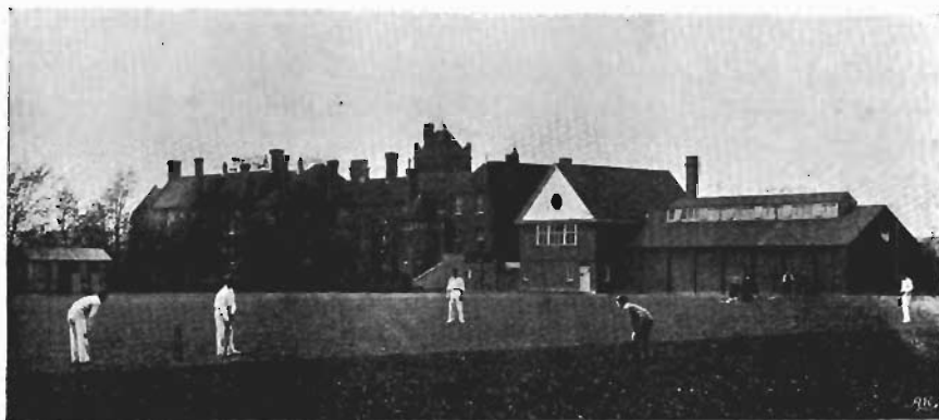
SAFFRON WALDEN SCHOOL. From Cricket Field.