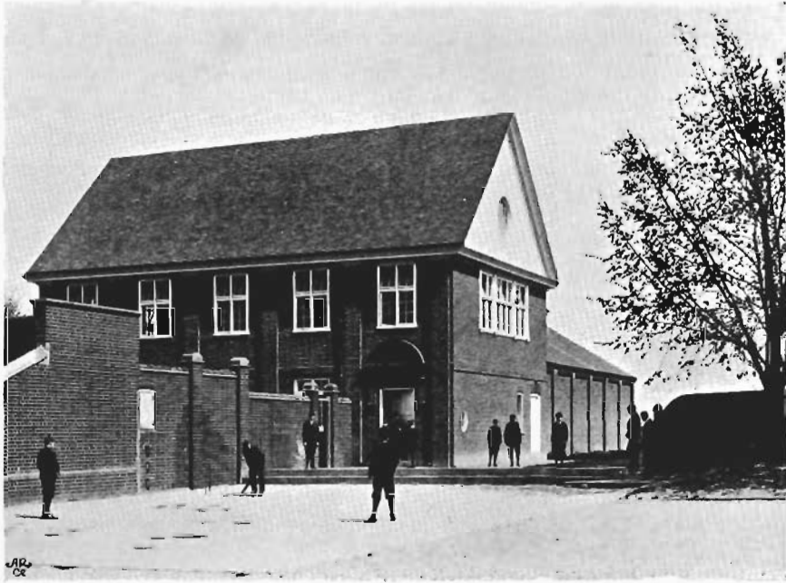
SAFFRON WALDEN SCHOOL. NEW GYMNASIUM AND SWIMMING BATH. From the Boys' Playground.