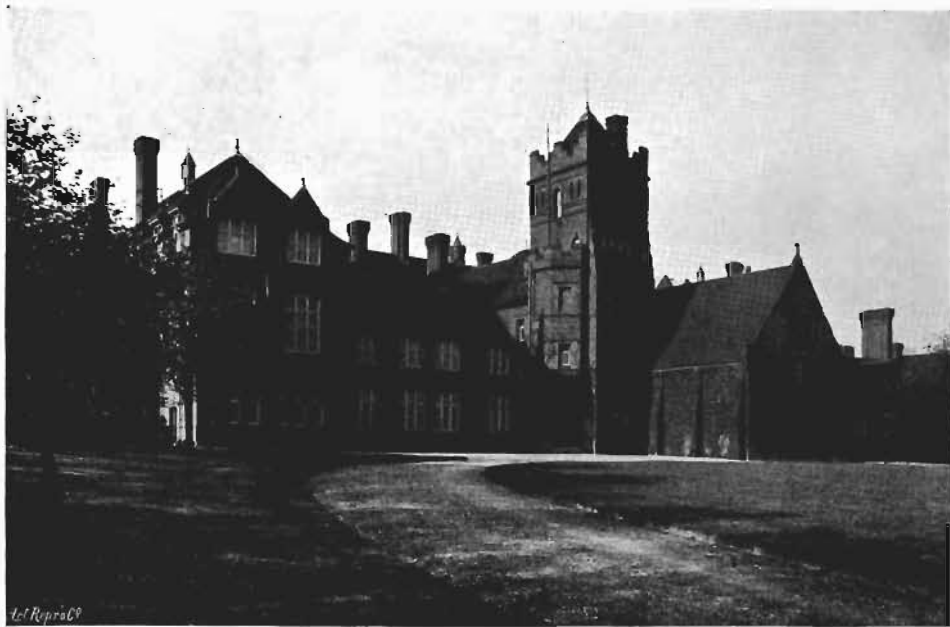
SAFFRON WALDEN SCHOOL. Front View.