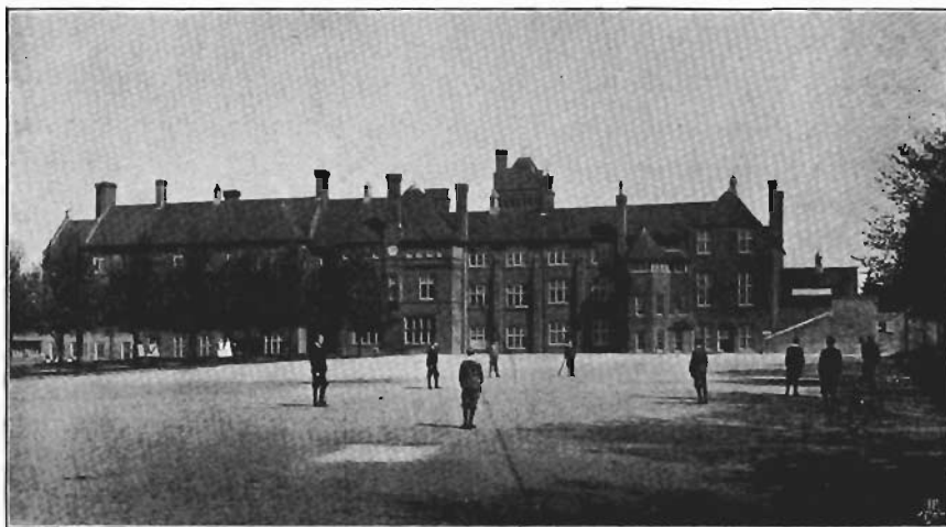
SAFFRON WALDEN SCHOOL.